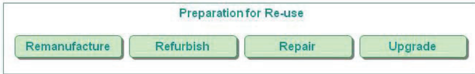
Figure 3: Alternative activities in preparation for re-use